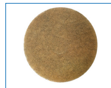
StoneFlash Pads Step 5