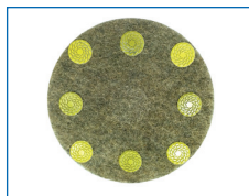
StoneFlash Pads Step 2