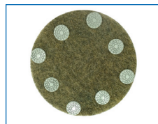
StoneFlash Pads Step 3