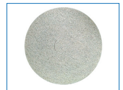
StoneFlash Pads Step 6