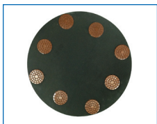
StoneFlash Pads Step 1

*Always rinse pads after use and store in breathable bag or box.